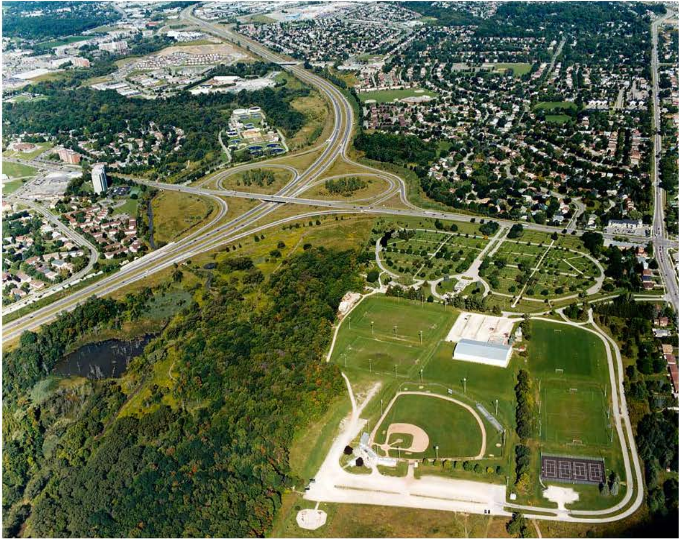
Photo reflects current land use.