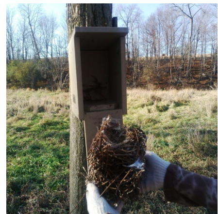
Cleaning out old nests from boxes