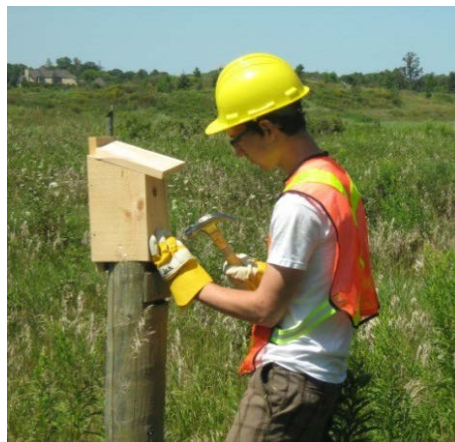
Repairing bird houses